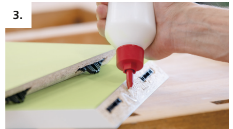
3. Apply glue.