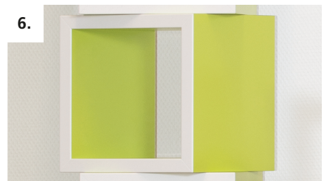
6. Ready-glued carcass without waiting times and without any clamps or adhesive tape.