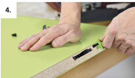
4. Press in the preload-clip to make it easier to join the components.