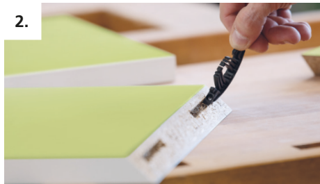
2. Slide in the connectors.