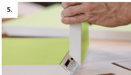
5. Assemble the components.