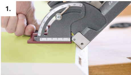
1. Cut all components.